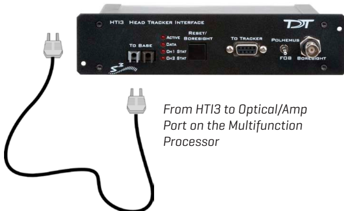
From HTI3 to Optical/Amp Port on the Multifunction Processor

Activity Lights on the HTI3. The Active LED indicates if the HTI3 is connected to a base station. This LED will flash slowly (~1 Hz) if this connection is not properly made.